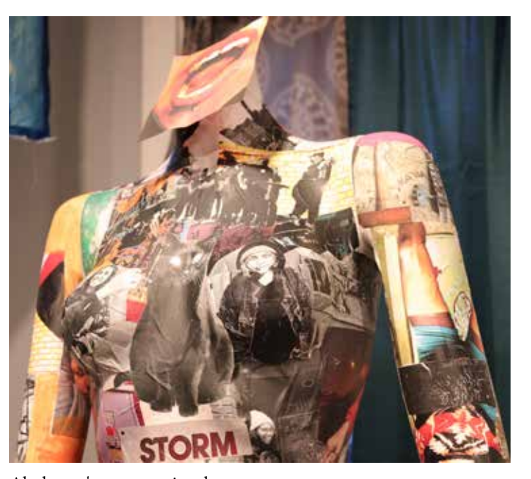
Aleshanee's mannequin, close-up.

Aleshanee collaged a mannequin whose svelte figure, assertive pose, and black gloves suggested a female superhero. She inserted a typed sheet with her artist's statement in the hand of her colorful avatar, whose hodge-podge of texts and photographic snippets of people, landscapes, animals, and graffiti interspersed with touches of bright pink, red, and green took on an almost cinematic quality; scanning the images as they slid around the torso, arms, and legs, one experienced them in motion. Describing herself as "a local student, artist, activist, and advocate," she noted the piece was inspired by Wigfall's focus on "art as a means for therapeutic expression, self-reflection, manifestation, and healing." Her piece "explores the visual and emotional landscape of Kingston, with a particular focus on 'safe places,' spots... where I and people like me...feel comfortable existing."