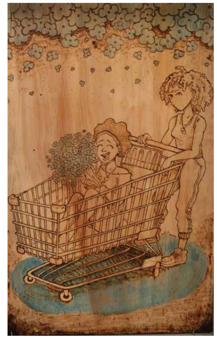
Our Place by Micah Fornari

Asa's series of collagraph prints were eye-catching in their unusual format—two large white paper circles, like ghosts of vinyl LPs, each framing a tiny circular print, viewed as if in the lens of a telescope. The titles, Ghost-town #1 and Ghost-town #2 , referred to the memories of the family businesses that occupied Uptown Kingston when Asa was growing up but have since vanished. The abstraction of the pieces was inspired by the "abstracted figuration" that was part of Wigfall's visual language, said Asa, noting that Wigfall's remark that "there were no images for what [I] wanted to convey" especially resonated with him.