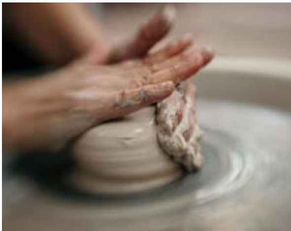
Kingston Ceramics Studio